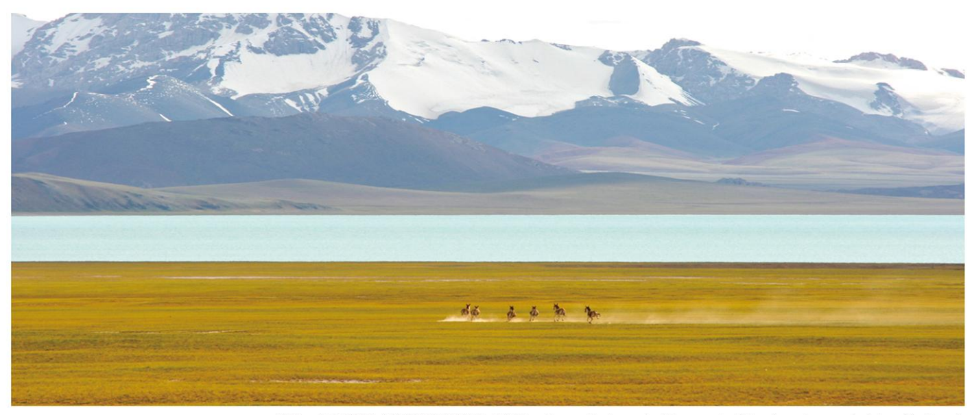
羌塘,中国面积最大的荒野地 Qiangtang, the largest wilderness in China

北部、新疆南部、青海西部、内蒙古西部等区域。总体而言,高质 量和较高质量荒野地主要分布于中国西部。在这些区域中,西藏羌 塘仍保存着大约 30 万平方公里的无人区;青海可可西里由于其突出 普遍价值,在 2017 年被认定为世界自然遗产地;三江源地区则被认 定为中国国家公园体制试点区之一,以保护黄河、长江和澜沧江河 流源头的景观。这些区域是中国国土中荒野度最高的景观,应重点 保护,并严格限制对环境有负面影响的土地利用变更、人工设施建 设和人类活动,从而为当代和子孙后代保存其荒野价值和荒野特征。