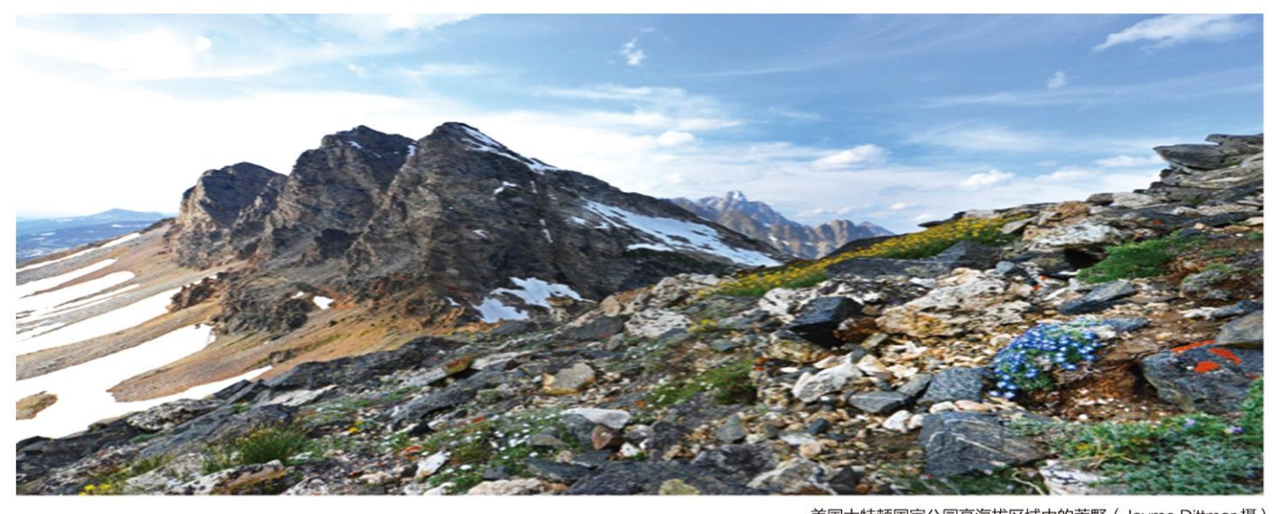
美国大特顿国家公园高海拔区域中的荒野 High altitude, Grand Teton National Park and wilderness, Wyoming USA

万斯·马丁 全球荒野基金会主席,世界自然保护联盟自然保护地委员会 荒野专家国主席 杨锐 清华大学景观学系系主任、教授,社会科学基金重大项目"中 国家公园建设与发展的理论与实践研究"首席专家 曹越 清华大学景观学系博士研究生